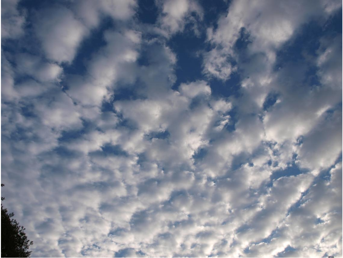
The cloud formation over Pratts Bottom at 6.30am on Monday 1 st September 2014